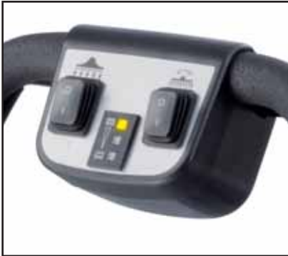
Self explaining control panel