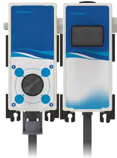
ProMax Slide 4 Product & Button 1 Product