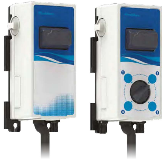
ProMax Button 1 Product

By combining the revolutionary technology of patented hydrodynamics and user friendly, image enhancing features unique to ProMax, SEKO has produced the perfect solution for all institutional and light industrial chemical dilution applications.